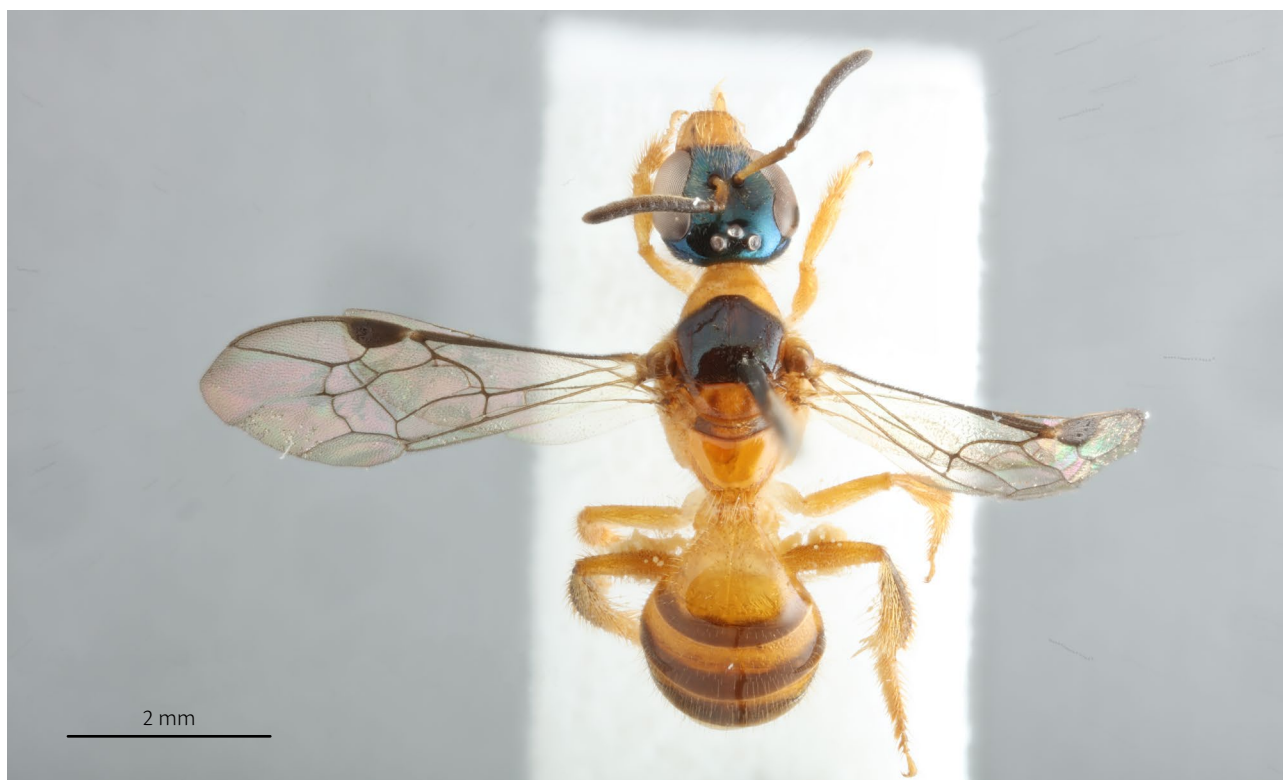
Figure 3. Holotype of Chlerogelloides paetzae sp. n. (dorsal view).

T1 marginal zone and T2 pregradular area with a continual brown band (figure 4). Band on T2 marginal zone broken medially, continuous across T3 pregradular area. Continuous broad brown band across T3 marginal zone extending laterally to midlevel of T3. T4 band rising medially and extending laterally to almost T3. T5 brown. T1–4 outside of brown bands honey yellow.