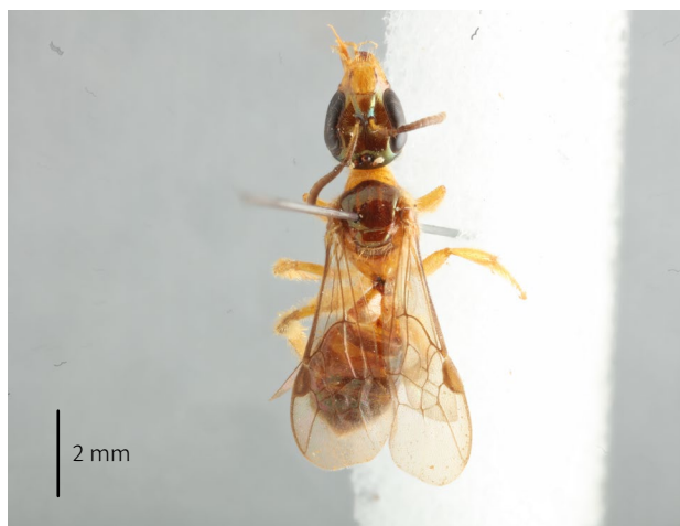
Figure 9. Female of C. femoralis (dorsal view).