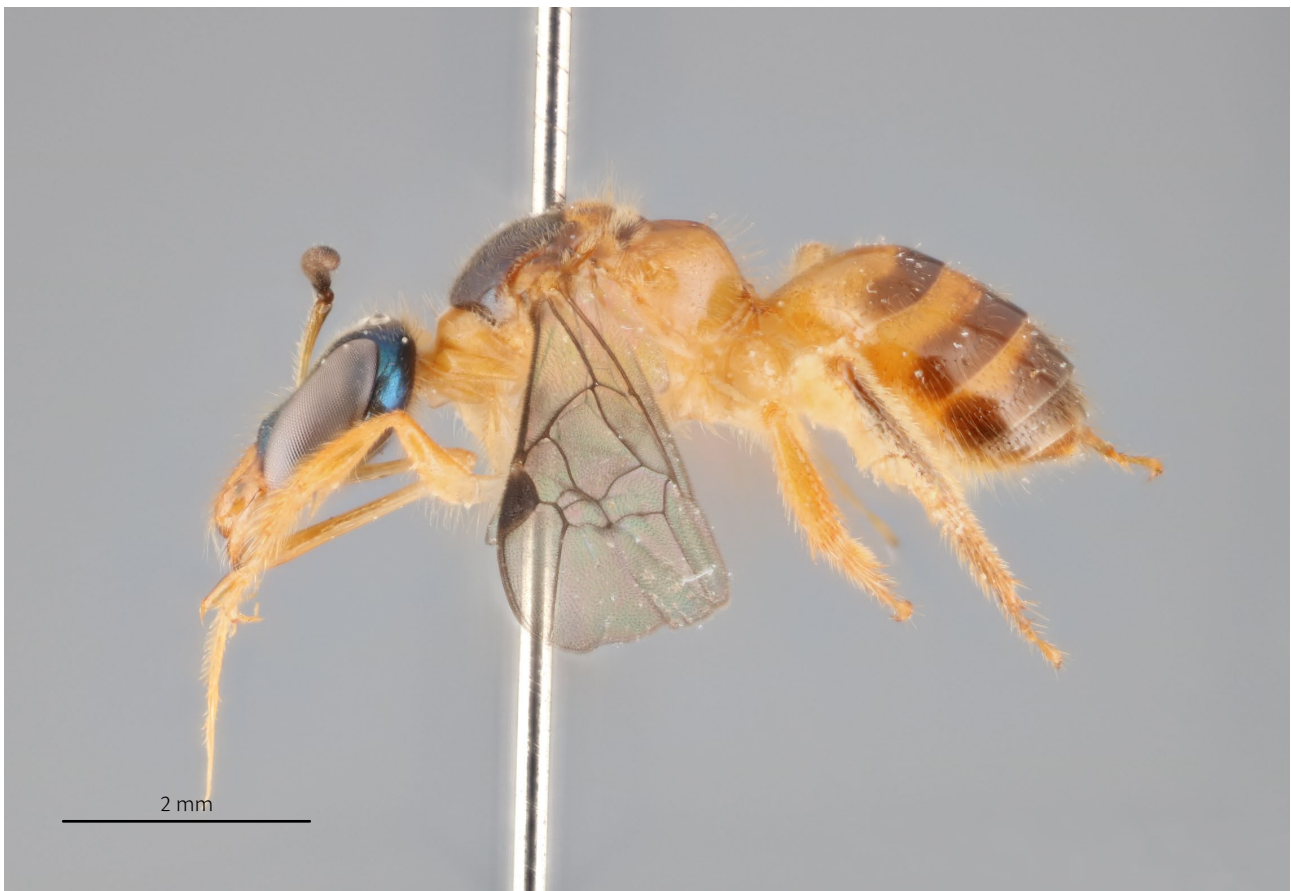
Figure 5. Holotype of C. paetzae sp. n. (lateral view).