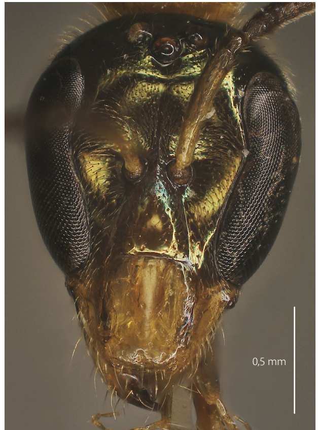
Figure 7. Face of female C. femoralis .