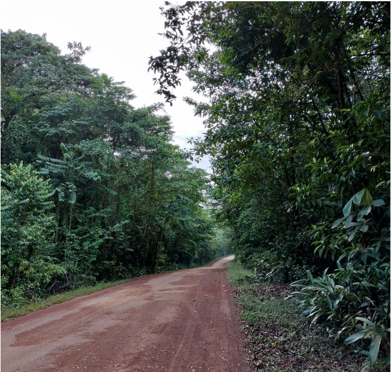
Figure 1. Type locality of C. paetzae sp. n. on Kaw Mountain, French Guiana.

of the capital Cayenne supporting typical Guianan rainforest habitat (figures 1–2). The type locality was alongside a road surrounded by dense forest on both sides. Terminology follows MICHENER (2007), except the use of the term mesoscutum instead of scutum. Tergites are abbreviated to T1–6.