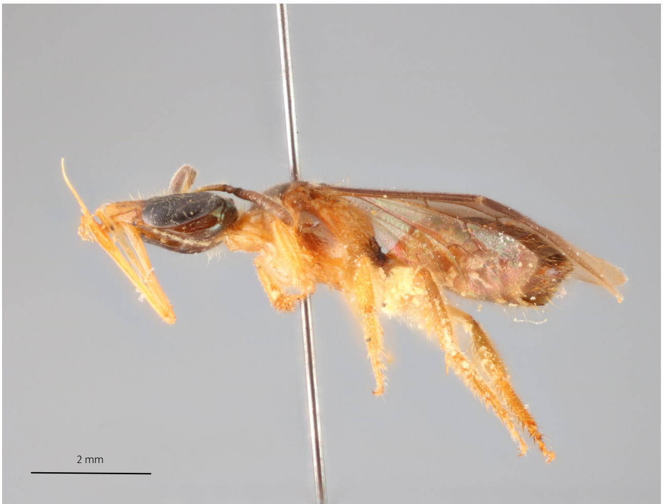
Figure 8. Female of C. femoralis (lateral view).