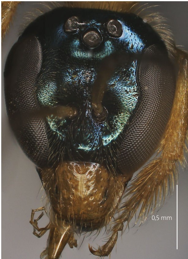
Figure 6. Face of C. paetzae sp. n. showing the medially straight line of the vertex and oval shape of the head.