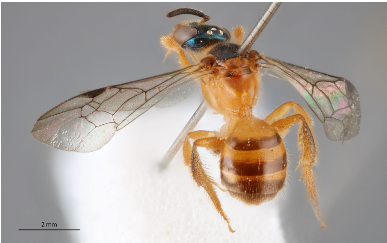
Figure 4. Holotype of C. paetzae sp. n. (quarter view).