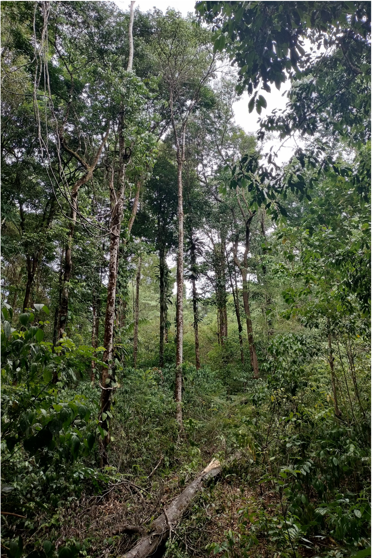
Figure 2. Forest on Kaw Mountain, French Guiana.